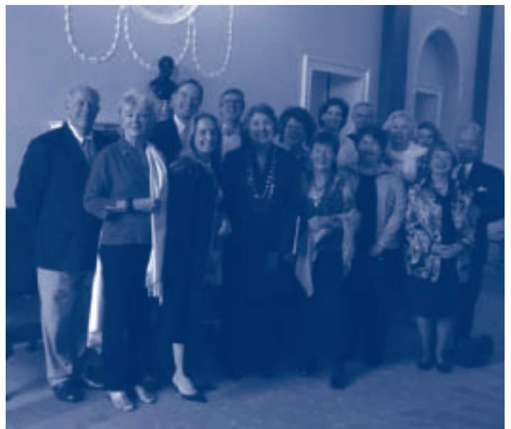
Lucan House tour in Ireland