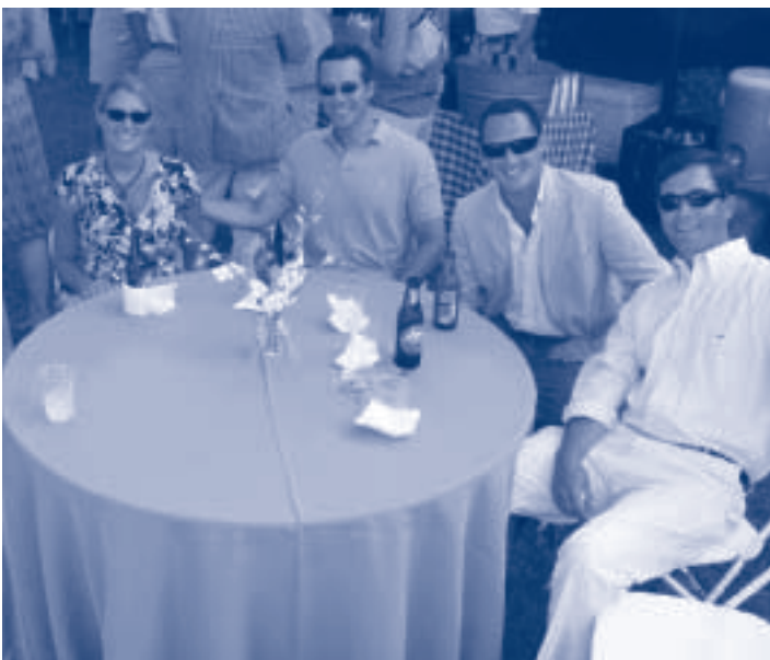
Medallion Circle Members at Gershwin in the Garden Event