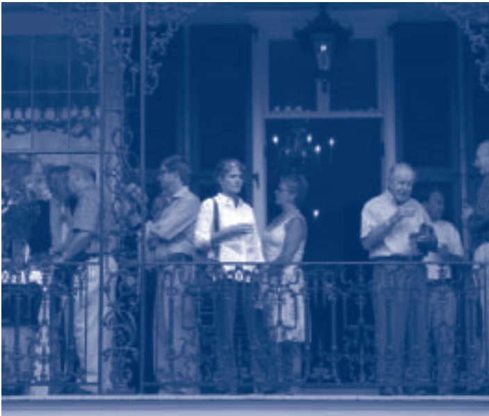
Hard Hat Tour 2007