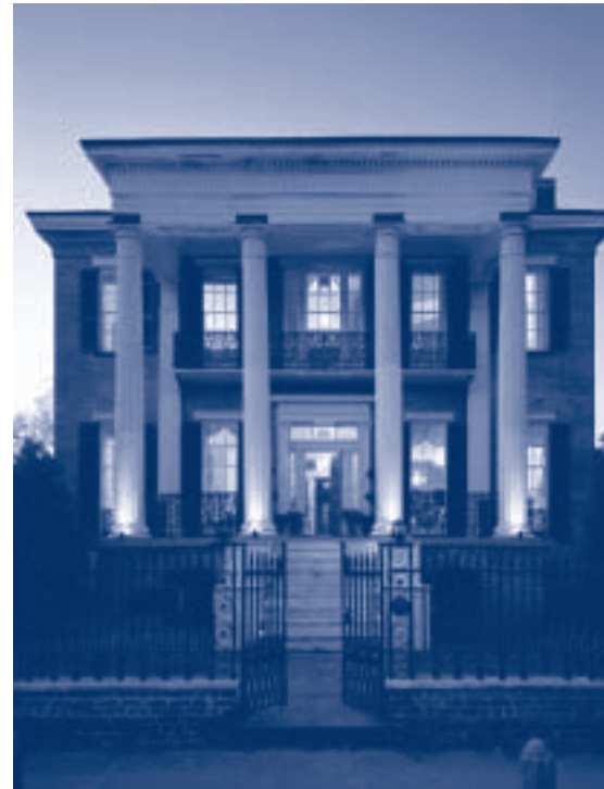
Fall Tour Home at 20 Charlotte Street