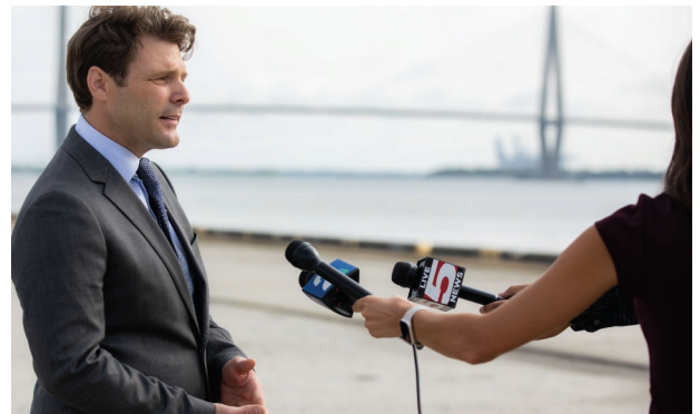
The Preservation Society of Charleston was there, on June 16, when the fresh start was announced for Union Pier

"It is in the lifeblood of our organization to demand better for Charleston..."